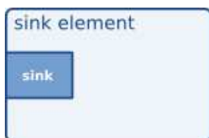
Figure 5-4. Visualisation of a sink element

Sink elements are end points in a media pipeline. They accept data but do not produce anything. Disk writing, soundcard playback, and video output would all be implemented by sink elements. Figure 5-4 shows a sink element.