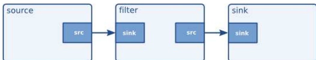
Figure 5-5. Visualisation of three linked elements

By linking these three elements, we have created a very simple chain of elements. The effect of this will be that the output of the source element (“element1”) will be used as input for the filter-like element (“element2”). The filter-like element will do something with the data and send the result to the final sink element (“element3”).